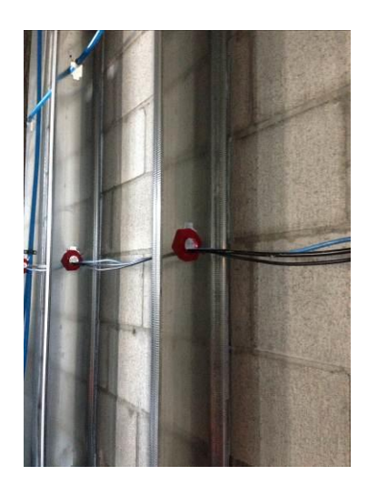
Page 3 of 7