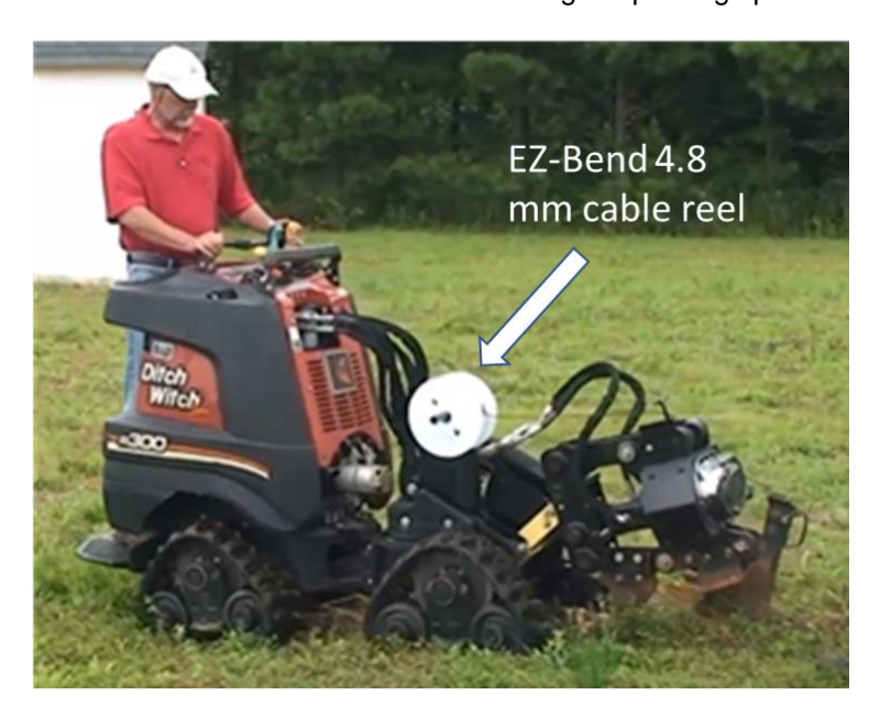
Page 6 of 7